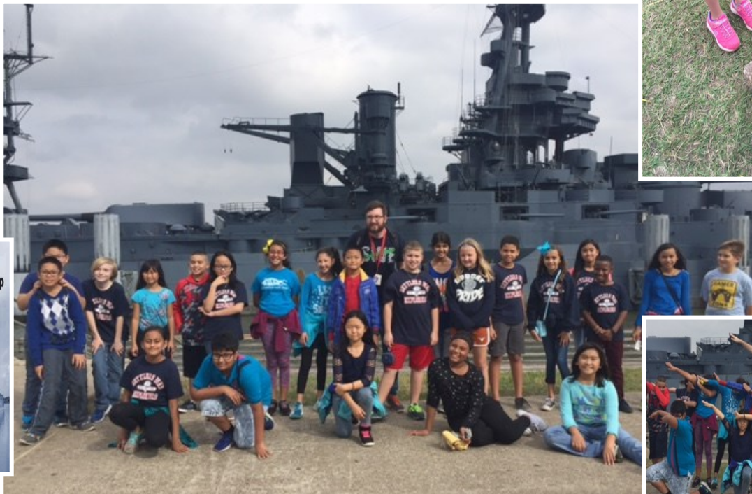
Battleship Texas (BB-35) America's Oldest Surviving Battleship